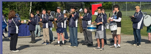
High School Marching Band (Middle school performed as well, they were great!)