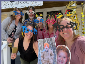
Central Office Team cheering graduates at district tour