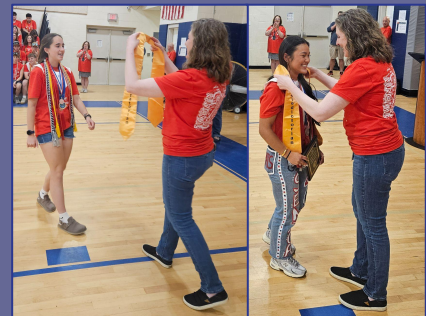
Cords and Coins Ceremony