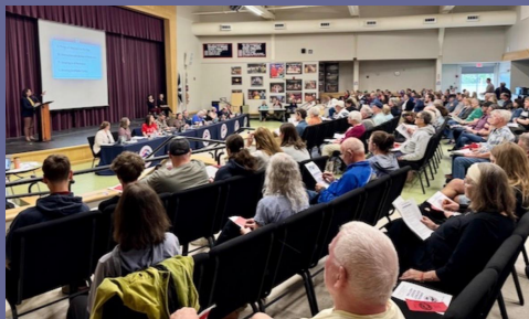
Budget Validation Meeting