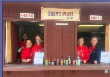
Back in the Snack Shack